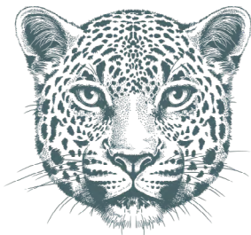
JAGUAR WEST DIRECTION

Working with a power animal is an instinctual process about who we are becoming, not about who we would prefer to be. It is up to us to learn its attributes as it reveals its wisdom.