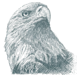
EAGLE EAST DIRECTION