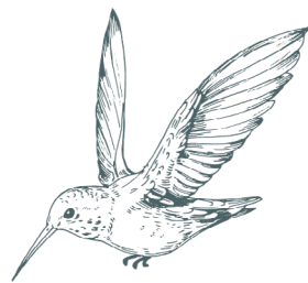
HUMMINGBIRD NORTH DIRECTION